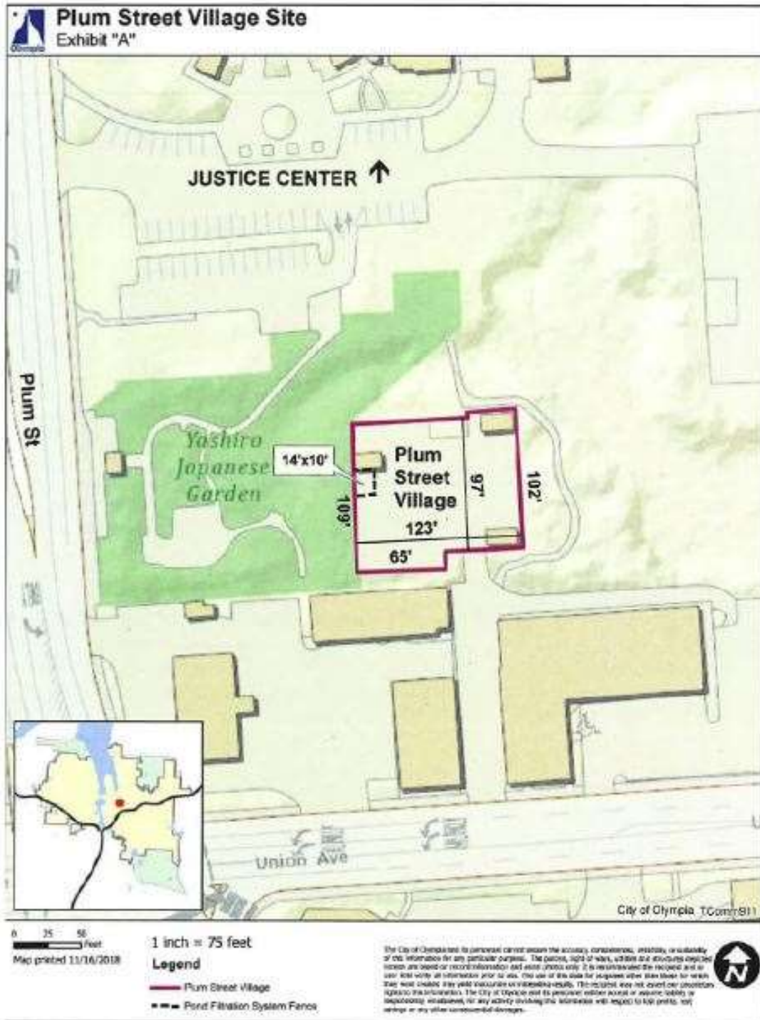
EXHIBIT A SITE PARCELS AND ZONING MAP